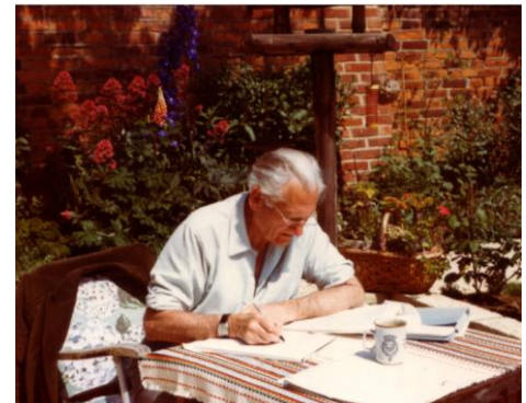
Doll at Home

Richard Doll joined the Communist Party as a reaction to the “anarchy and waste” of capitalism in the 1930s. He treated the blistered feet of the Jarrow Marchers, served as a medical officer at the retreat to Dunkirk, and campaigned for a National Health Service before the end of the Second World War. At that time, British men had the highest incidence of lung cancer in the world. In 1950, Doll and Bradford Hill showed that smoking was ‘a cause and an important cause’ of the rapidly increasing epidemic of lung cancer. In 1989 the British Medical Journal described Doll as “Britain’s most distinguished doctor”.